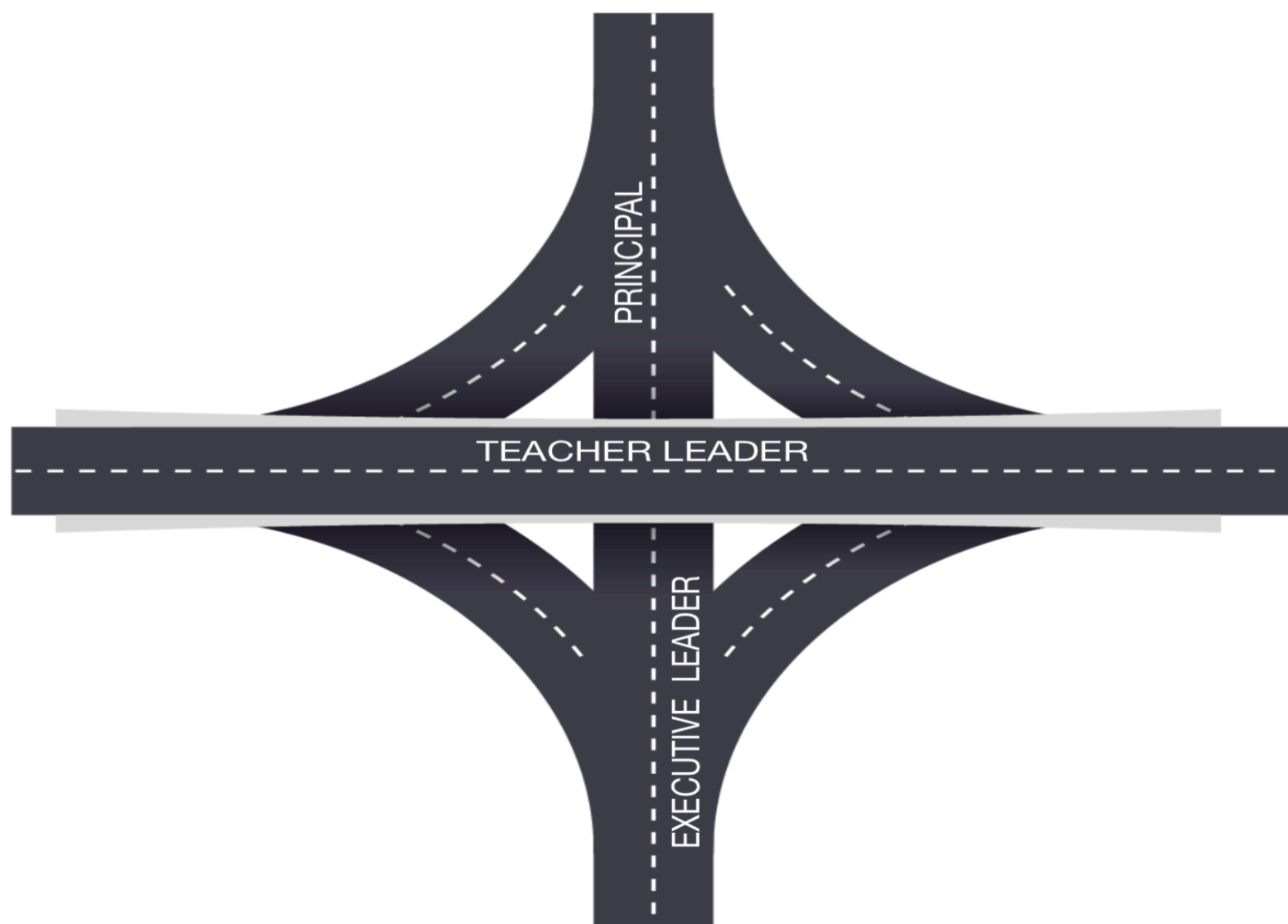
Figure 2: Freeway interchange metaphor for Catholic school leadership path development

On the other end of the leadership spectrum, one can envision the path to the executive leadership level of a Catholic school