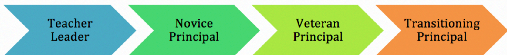
Figure 1: Pipeline metaphor in Catholic school leadership

The path to leadership is often conceptualized as a pipeline. In this metaphor (see Figure 1), a candidate progresses in a unidirectional fashion from one point of the leadership continuum to another. Sometimes, this model places a myopic focus on principalship development to the